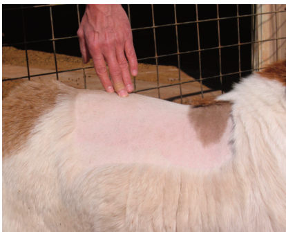
BCS 4. The backbone and ribs cannot be seen. The ribs are sleek and the bones can barely be felt under a layer of fat.