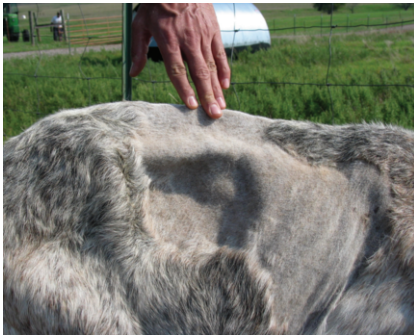
BCS 1. Weak and bony. You can fit your fingers between the bones of the backbones and rib bones. No fat and little muscle.