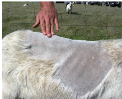
BCS 2. Slight fat cover on the ribs, but you can still see and feel the backbone and spaces between the ribs.