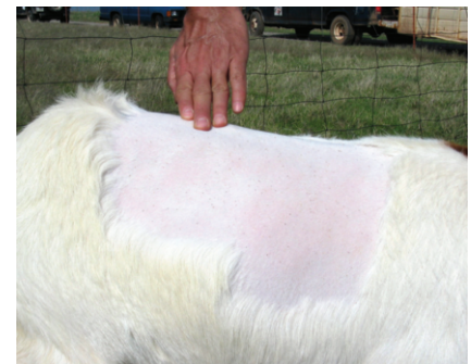
BCS 3. The backbone is visible, but does not stand out. You must press firmly to get your fingers between the ribs and they have a moderate covering of fat.