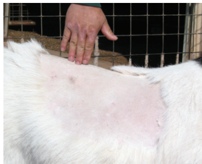
BCS 5. The backbone and ribs are so deeply covered in fat as to not be seen or felt.