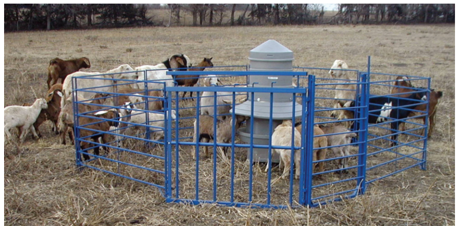
Creep feeders allow you to provide extra energy and protein to growing kids without competition from their dams.

As goats approach the breeding season, they should be in good body condition, neither too thin nor too fat. Underweight and overweight goats have difficulty breeding and becoming pregnant. They should have a body condition score of three on a scale of one to five, with five being obese and one being emaciated. See FSA9610, Body Condition Scoring